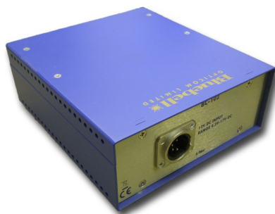
BC102 showing 4 pin XLR