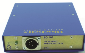
BC101 showing 4 pin XLR