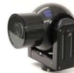
4K Robotic Camera

This system layout is for use with 4K Cameras. Each 4K Camera Channel requires one Hybrid Cable and one Silhouette. There is option for expansion for up to four 4K Camera Channels.