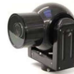
4K Robotic Camera