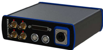
Hothead Silhouette remote unit