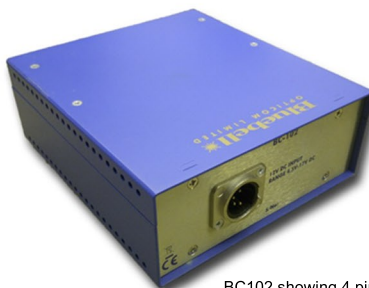
BC102 showing 4 pin XLR