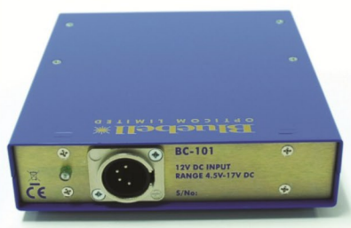
BC101 showing 4 pin XLR