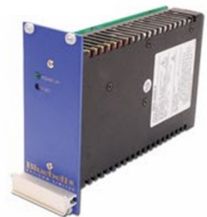
PS100 Power Supply