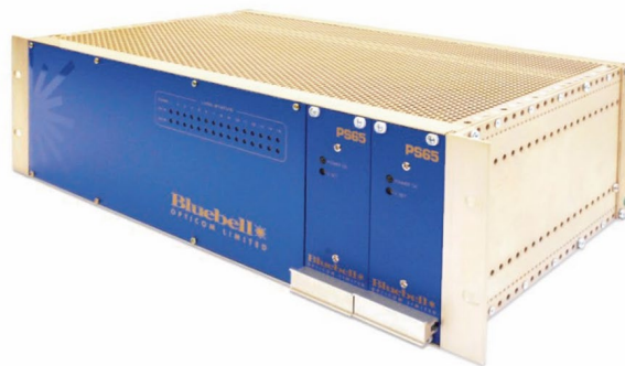
BC100 3RU 19" frame